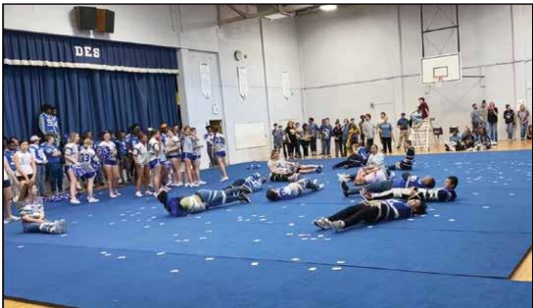
Teachers at Davidson Elementary School participated in a chaotic card game during a pep rally Friday at the elementary school.

Tuesday was another eventful day, especially for the Senior Class of 2024.